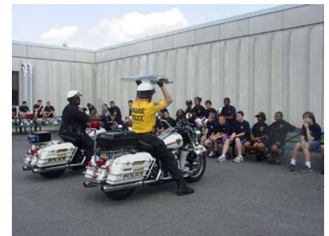
2009 Junior Academy participants.