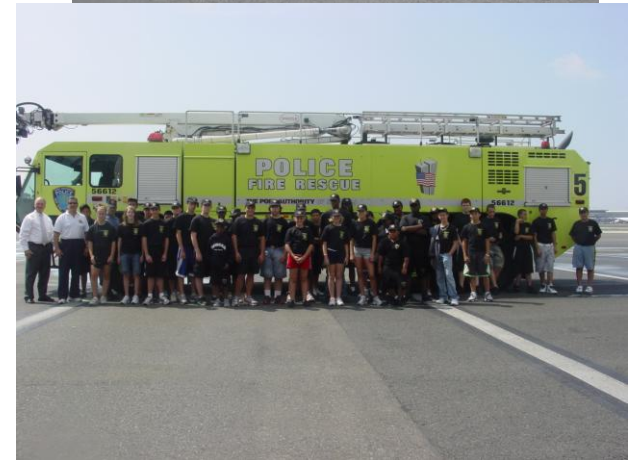
2010 Junior Academy participants with NJ National Guard helicopter (above) and Port Authority PD at Newark Liberty Airport.