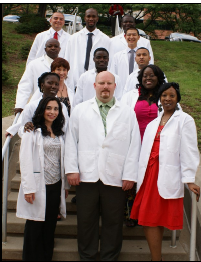
READY FOR THE NEXT STEP: Students in ECC's radiography program attended a pinning ceremony held in their honor on August 18.

Even though Commencement was held in May, there are a few more students who call themselves Essex County College alumni as the result of two graduation ceremonies held on the same August day.