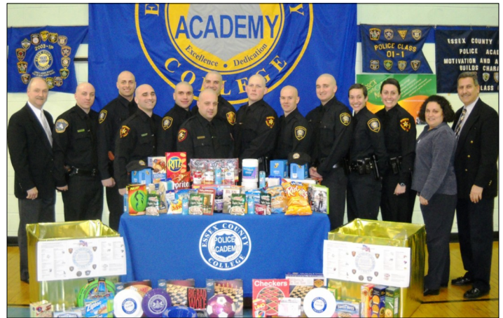
GIFTS FOR THE TROOPS: Recruits from ECC's Police Academy collected food, toiletries, and recreational items for an U.S. Army platoon stationed in Afghanistan. The items were collected in January and February. The drive, which showed support to our armed forces, served as a class community service project. The class pictured above will graduate from ECCPA on March 15 after 22 weeks of training.