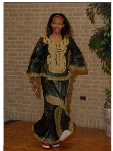
WALK THE WALK: An ECC student walks on stage to perform in the "Exposition of African Culture" event held on February 23 in Morton A. Siegler Hall.