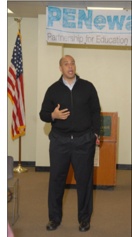
Education is a Top Priority: Mayor Cory Booker kicks off PENewark’s Educators Forum held at Essex County College in early December.

ECC’s College YES program is engaged with PENewark in all phases of activities in the college-wide effort to support the best quality of education in the communities we serve.