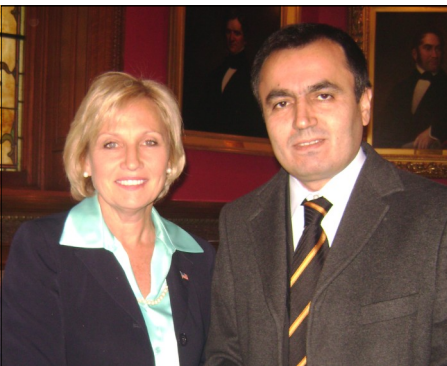
GREETINGS FROM THE STATE HOUSE: Lieu-tenant Governor Kim Guadagno (left) welcomes Director Kadir Çakir, of Turkey’s Ministry of the Interior and the rest of the delegation to the State House on January 12.

Essex County College hosted a visit by a 35-member delegation of district governors from Turkey from January 5 through 14. The 10-day visit was part of a two-month visit to the United States. The Turkish guests, many of whom were in this country for the first time, attended daily seminars at the main Newark campus and visited government agencies in Newark and Trenton. During a tour of the New Jersey state