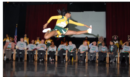
CAUGHT IN THE AIR: An ECC cheerleader completes a challenging stunt while the Middle States (MS) Steering Committee looks on during MS Prep Rally in late March in the Mary Burch Theatre.