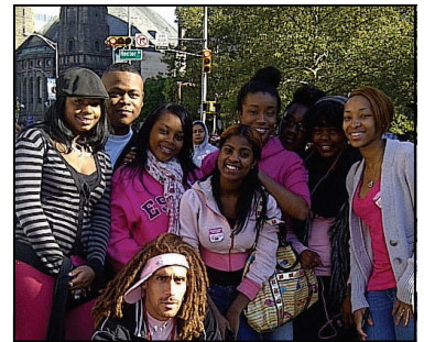
ECC STUDENTS “MAKE STRIDES” IN THE COMMUNITY: Members of the Essex County College cheerleaders, Fashion Entertainment Board, and women’s basketball team participated in the American Cancer Society’s Making Strides Against Breast Cancer walk on October 16. The funds raised go to continue the fight against breast cancer and increase awareness of the need for early screening and treatment.