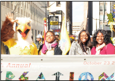
ART NEAR THE PARK: Newark high school students took to the streets of Newark to show their creative side in the fourth annual Creation Nation Art and Peace Parade.

Essex County College celebrated National Arts & Humanities Month in October with its participation in two art events — the Creation Nation Art and Peace Parade and Harlem Book Fair .