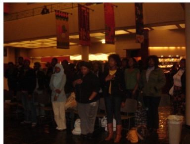
Everyone stands to sing Nigeria's national anthem