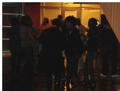
Students dancing to Nigerian music and having a good time